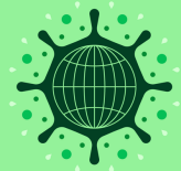
Stop the Spread